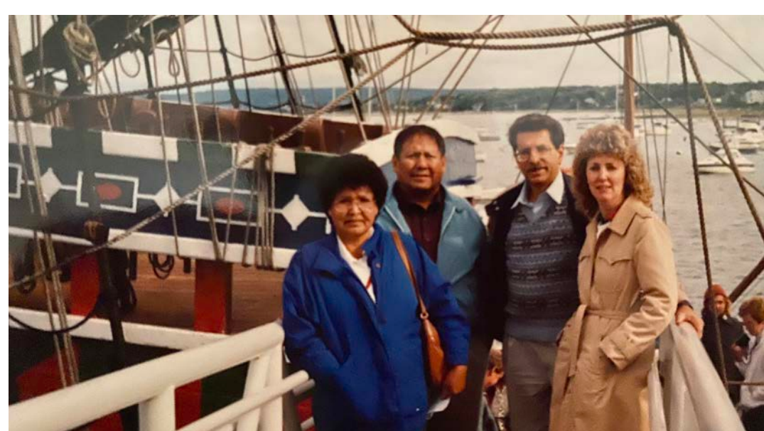
13 NAVAIO NEIGHBORS 2022